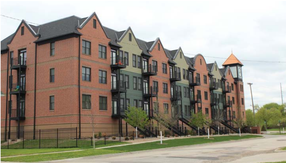
CITY OF CEDAR RAPIDS

Projects being developed by Compass Commercial are also using different building strategies than before the flood, including lifting up the building and changing some of the construction techniques to minimize potential sewer backup. City staff and officials are also encouraging rebuilding in flood-resistant ways. "As we're building back, we're looking at opportunities to build structures with parking on the first floor and elevated mechanical systems," Mitchell said. "Those types of strategies are being incorporated [in various projects]; it really just depends on location and housing product type."