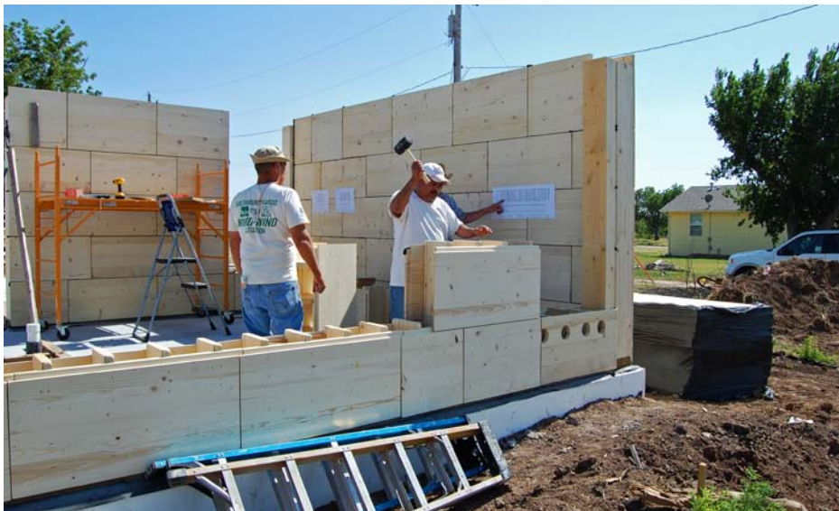
GREENSBURG GREENTOWN/JOAH BUSSERT

Howell, who was involved in rebuilding a number of homes and other buildings in Greensburg, cites reinforcement and ensuring that the entire structure is bolted to the concrete as appropriate techniques to increase the chances of a structure's survival during high wind events. Howell worked on the Meadowlark House with Greensburg GreenTown, which incorporated a prefabricated wood block wall system used in Europe, known as the Highly Insulated Building (HIB) system. Though still under construction, the house serves as a demonstration project for the innovative system. The cost of shipping the blocks produced overseas makes it an expensive strategy in the United States today, but the housing assembly technique using the blocks is quick, and the blocks themselves are toxin free and can withstand winds up to 195 miles per hour. Howell has been involved in several efforts to locate an HIB facility within the United States.