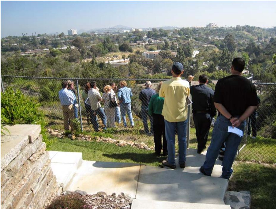
NFPA FIREWISE COMMUNITIES PROGRAM

Community leaders in Talmadge demonstrate wildfire safety challenges on a site visit with Firewise representatives.