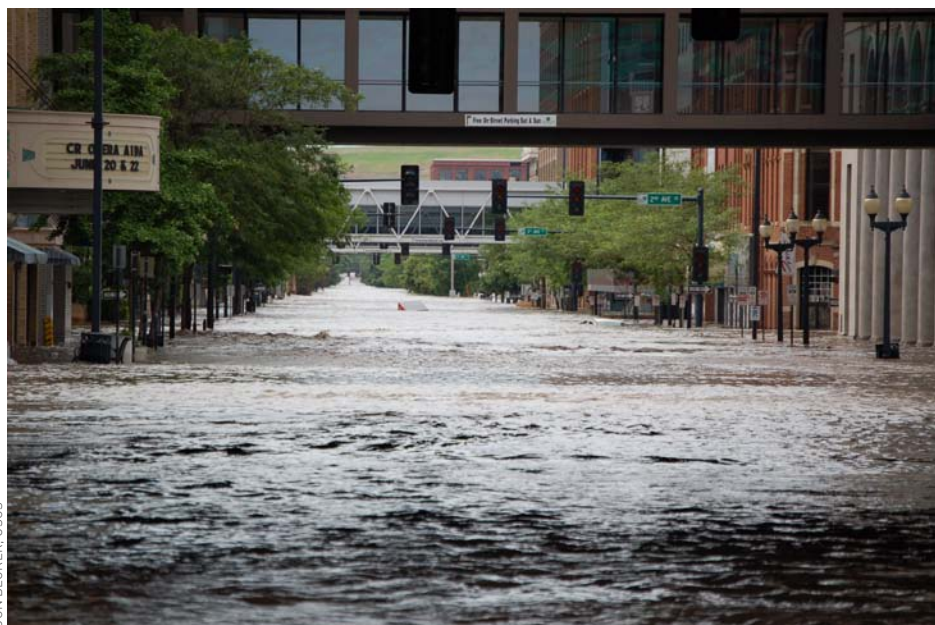
Flooding in downtown Cedar Rapids after the Cedar River rose a record-setting 31 feet.

In June 2008, a record-setting flood caused serious damage to the housing and building stock of Cedar Rapids, Iowa, affecting over 5,000 residential properties and nearly 20,000 residents. 61 Planners and public officials quickly mobilized residents to create a vision and plan for rebuilding, with a goal of protecting the city from similar events through modified land use plans. A process was implemented to encourage developers to rebuild in areas of the city close to downtown, using high-quality and sustainable techniques. Post-flood, many partners and stakeholders in Cedar Rapids have been working diligently on flood recovery and future planning strategies to create sustainable, resilient, and healthy homes, buildings, and places.